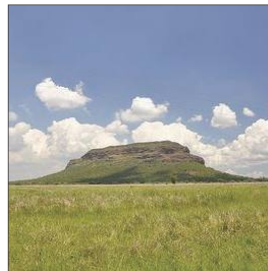
Kranskop is an iconic landmark of Modimolle

TIGER WHEEL & TYRE WELCOMES YOU TO MODIMOLLE!