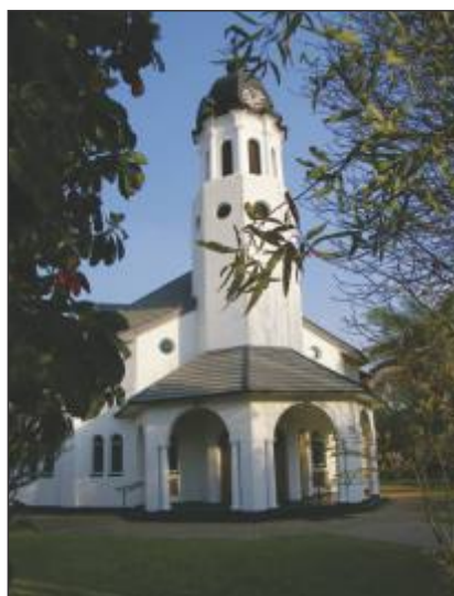
The Dutch Reformed Church Waterberg was established in 1859.

With plenty of retail outlets, you will find all you need at Modi Mall. Please enjoy your visit to Modimolle and remember to stop for your favourite Wimpy Coffee and burger before you hit the N1 to take you home.